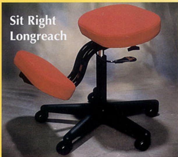
Sit Right Longreach