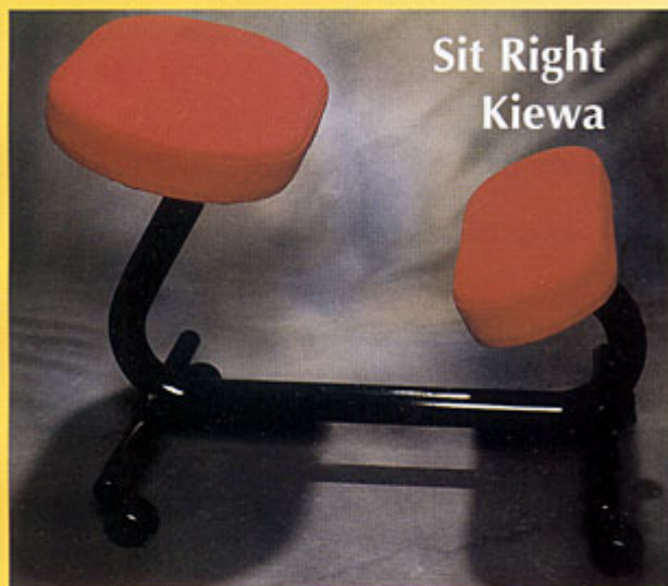
Sit Right Kiewa