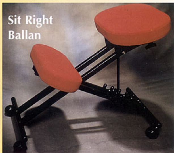
Sit Right Ballan