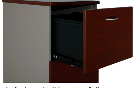
Soft close, ball bearing full extension runners