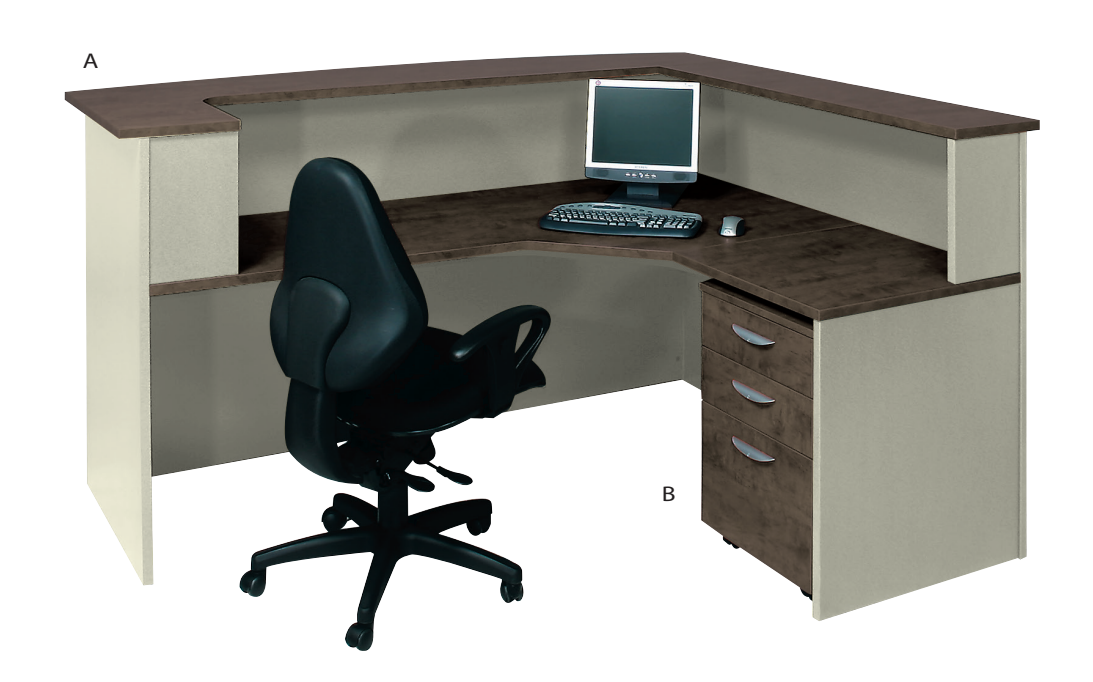
Ergo Curve Reception Desk Lateral Filing Credenza with Pigeon Hole Hutch

A: 2100 x 1800 x 750 x 750 x 1100 High B: 560 x 470 x 665