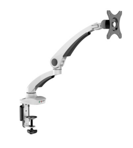
SMARM Single Monitor Arm

ADD A MONITOR ARM AND KEEP YOUR RAPIDSPAN ELECTRIC DESK OR RAPID RISER WORKSPACE FREE.