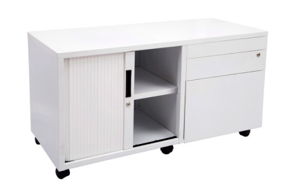
CADDY Available in White only.

The EM300 offers full ergo adjustment at a mid price point.