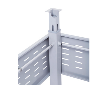
SSCP Corner Pole