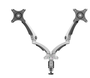
DMARM Dual Monitor Arm