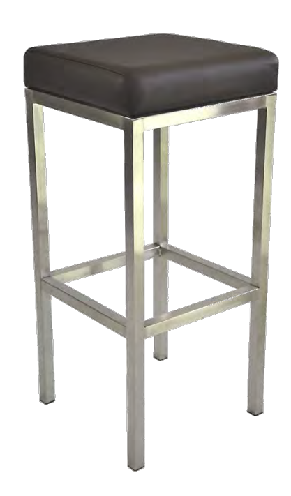
SUZIE Brushed stainless finish.