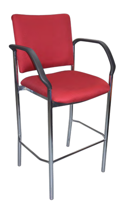
MSTDA Round back drop arms with optional chrome finish