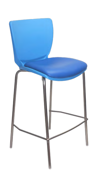
LARKST/S Seat upholstery