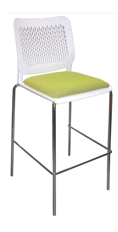
HALST/S Seat upholstery