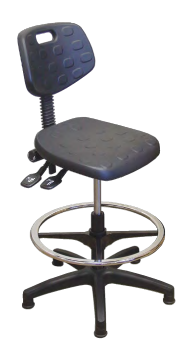
PUSQD with optional glides