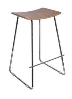
ELISTVEN Natural oak seat with optional chrome finish