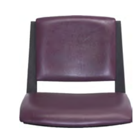
ZAPPB/SB Seat and back upholstered