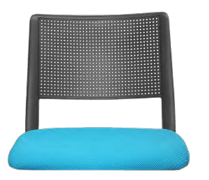
NEPPB/S Seat upholstered