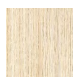
Formica Natural Oak