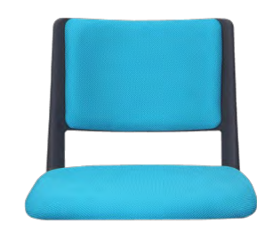
NEPPB/SB Seat and back upholstered