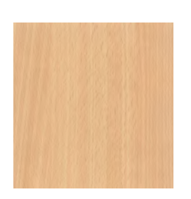
Laminex Select Beech