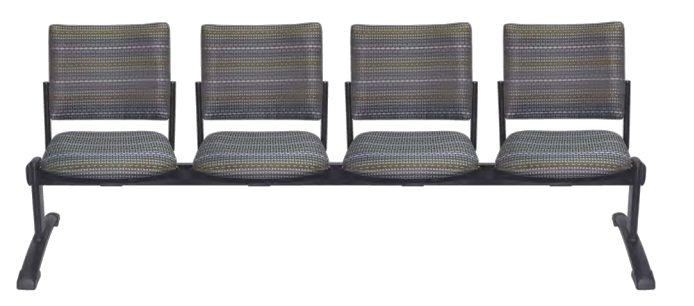
4 Seater 2480mm Length