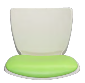
LKB/S Seat upholstery