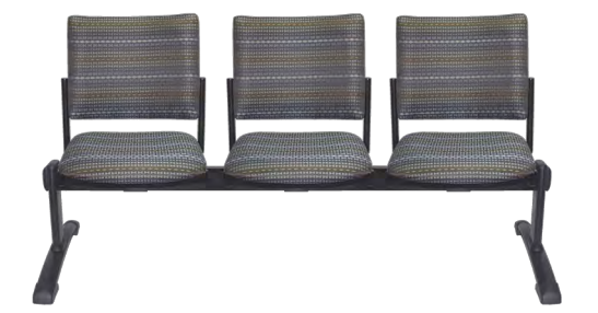
3 Seater 1870mm Length