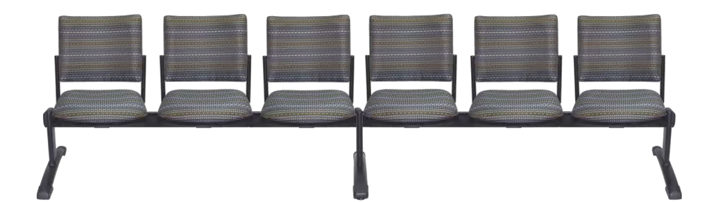
6 Seater 3580mm Length