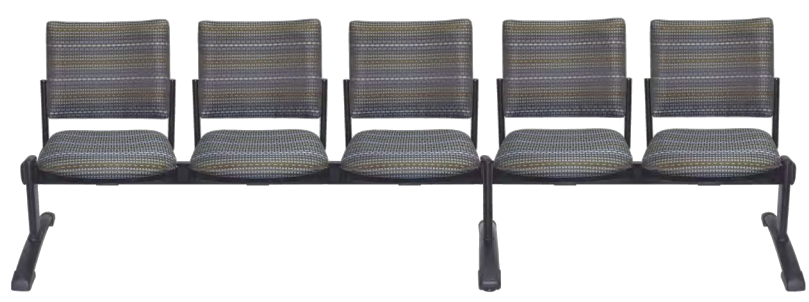
5 Seater 2970mm Length