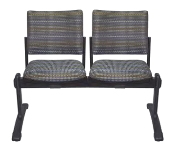
2 Seater 1250mm Length