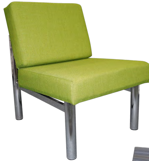
PROF01 Single seat