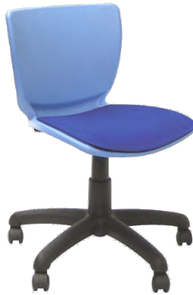
LARKTASK/S Seat upholstery