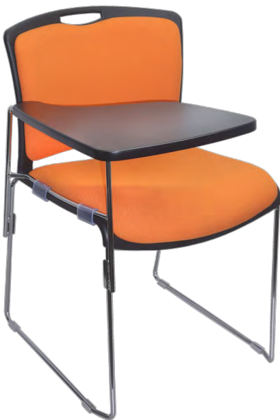
HUNTTAB/SB Seat and back upholstery