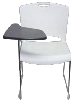
HUNTTAB No upholstery