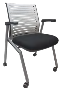
SCHA With arm