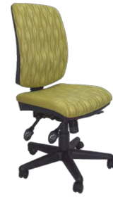
Clerical & Managerial