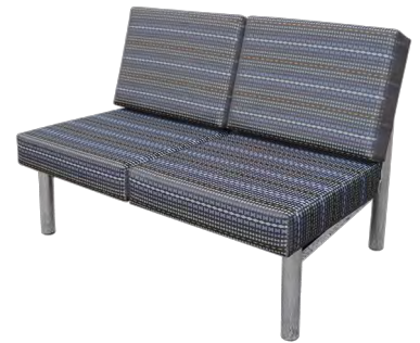
PROF02 2 seater