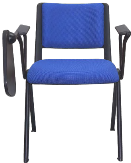
NERTAB/SB Seat and back upholstery