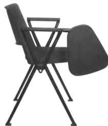
NERTAB No upholstery