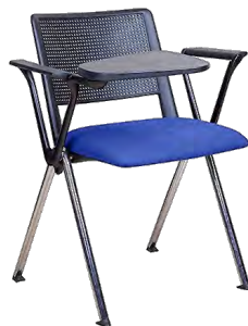
NERTAB/S Seat upholstery shown with chrome frame