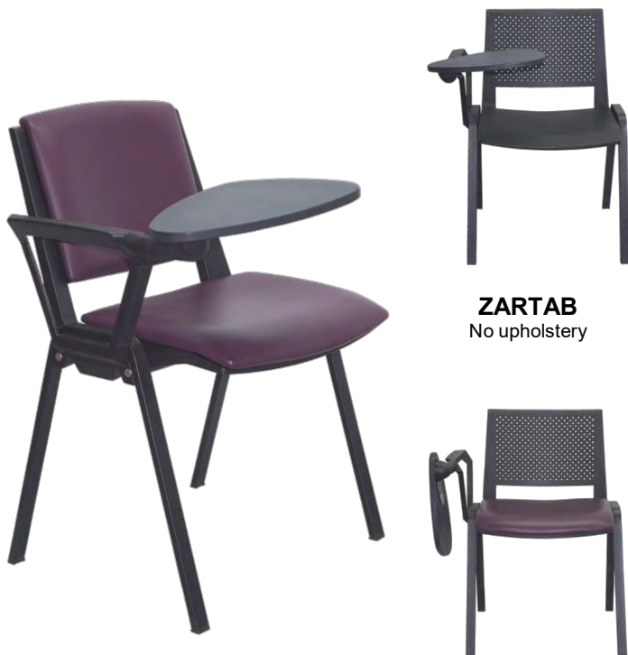
ZARTAB/SB Seat and back upholstery