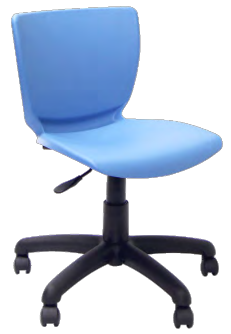
LARKTASK No upholstery