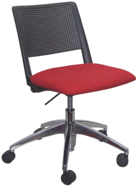
NERSTU/S Seat upholstery