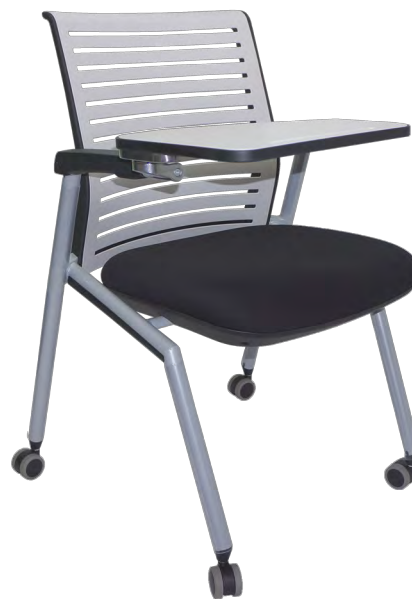
SHTAB Tablet arm