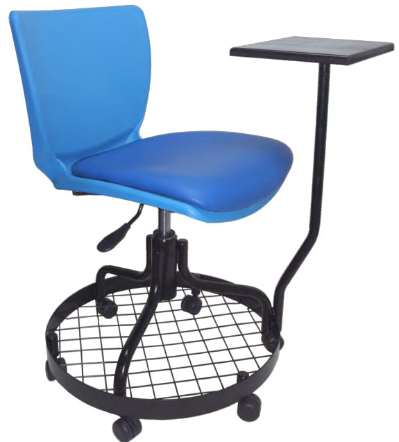
LARKTAB/S Seat upholstery