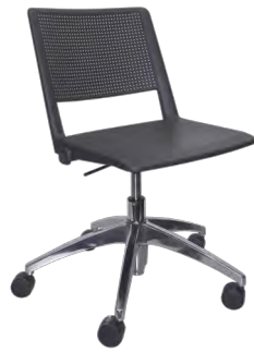
NERSTU No upholstery