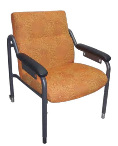
BELLA01 Medium back with graphite ripple finish