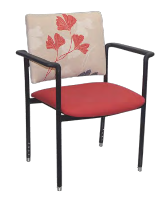
ABMVASQ Square back