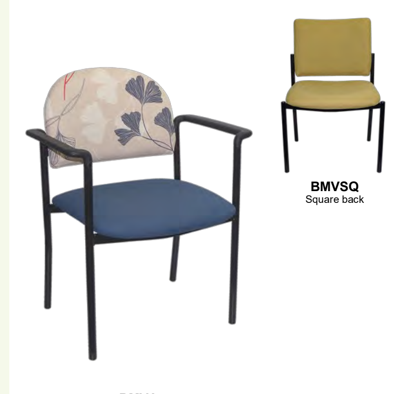
BMVA Round back with optional straight arms