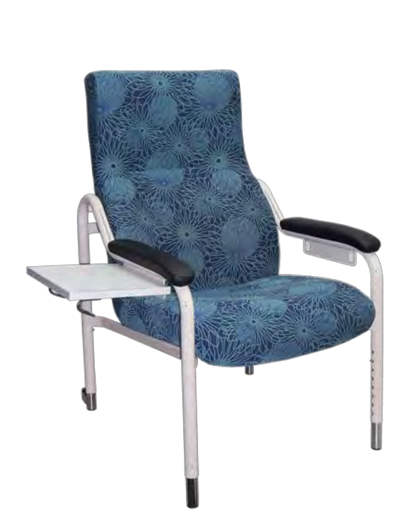
BELLA02 High back with beige finish and optional side table